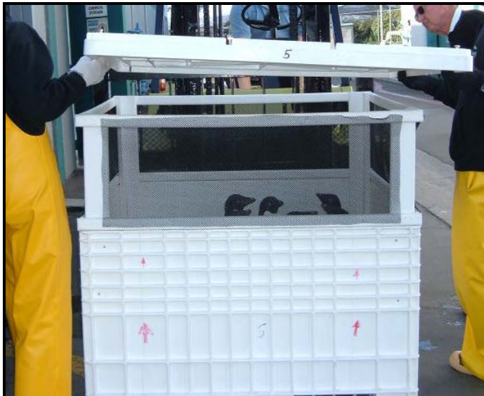
Figure 1. Example of a crate made of hard white plastic with a modified screened area added around the top to increase height and air flow.

(1.5.10) Temporary, seasonal and traveling live animal exhibits (regardless of ownership or contractual arrangements) must meet the same accreditation standards as the institution's permanent resident animals.