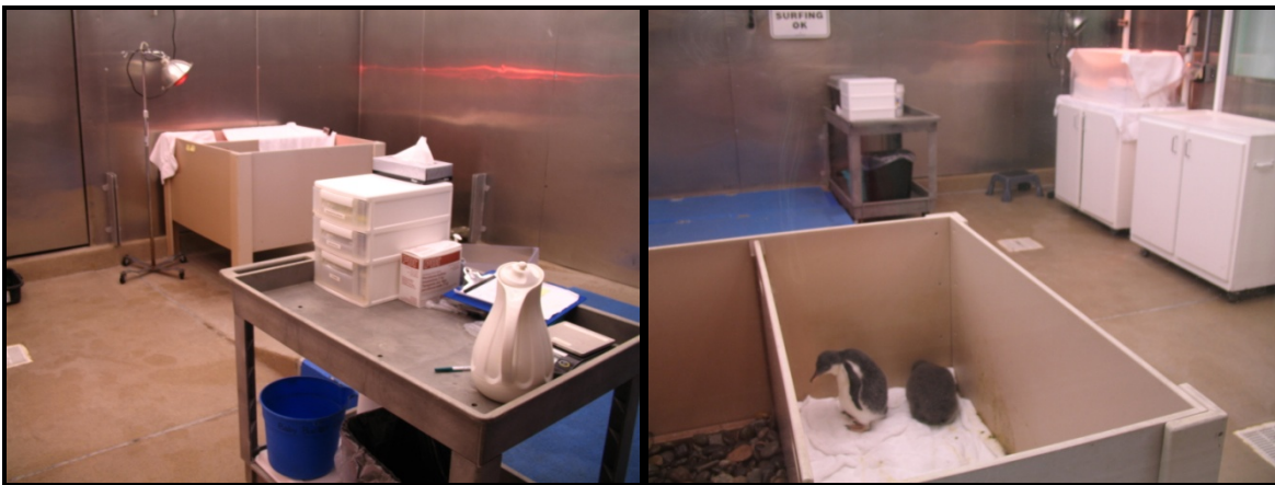
Figure 16. Left: A brooder bin in the corner; note how it is elevated on legs above the floor. In this instance a heat lamp has been provided on a portable stand; such provision of heat may be needed for some chicks during the initial transition to the bin following the end of the guard stage. Right: Gentoo chicks in one side of the divided bin with toweling over the rock substrate.

Penguin hand-rearing vitamin regimen: Recommended for small species ( Spheniscus magellanicus , S. humboldti , Pygoscelis adeliae , P. papua , P. antarctica , Eudyptes chrysolophus .)