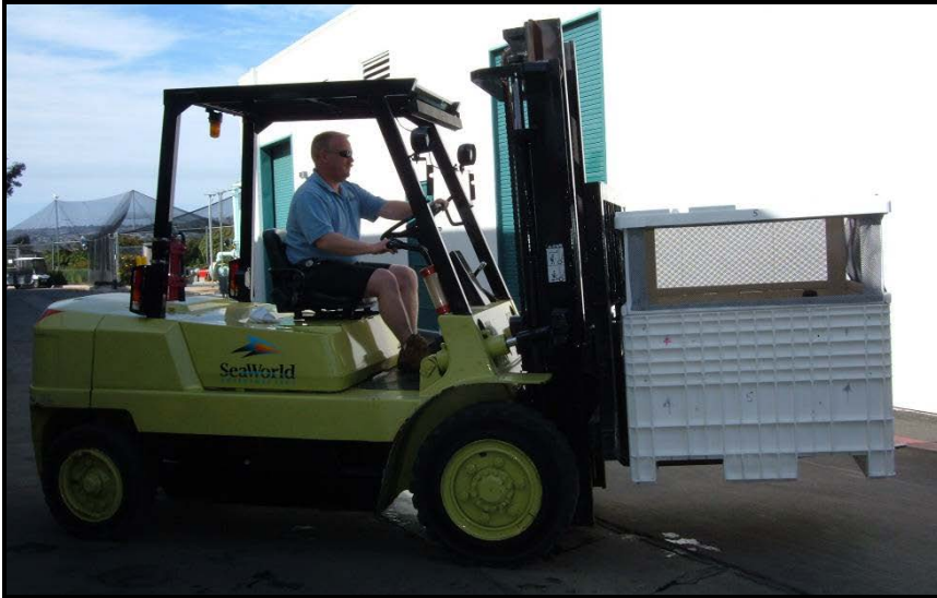
Figure 2. Crates should have slots built into them so that a forklift can easily move them.

Large crates: Large crates are used on charter flights primarily due to the size and weight. Dimensions of the most commonly used boxes are 1.1 m x 1.2 m x 1.0 m (44 in. x 48 in. x 40 in.). Large crates will hold four medium sized penguins (Gentoo and Macaronis) or five to six small sized penguins (Chinstraps, Adelies, Rockhoppers, etc.). For birds that are aggressive, no more than four small penguins should be placed in a crate. One to three King penguins can be shipped in these large containers.