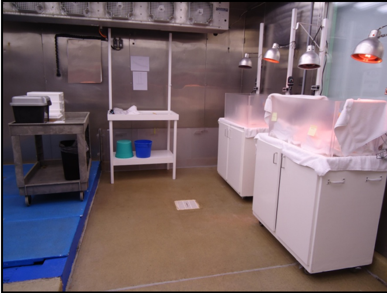
Figure 13. Two Plexiglas ® brooder boxes set on top of brooder bases with heat lamps secured. Towels are draped over one or both sides to control airflow. Note the fans in the upper left corner; these provide cooling and good air movement. It is important that the room be cooled to offset the production of heat by the heat lamps. Lighting is provided by dimmable full-spectrum 40W fluorescent light bulbs. Photoperiod during the neonatal period is set to match exhibit parameters.