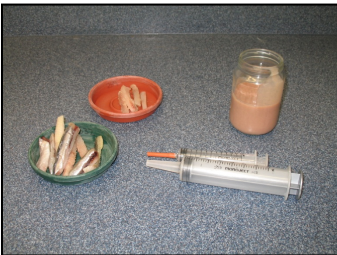
Figure 12. Syringes with both catheter tip and applied portion of short feeding tube along with baby food jar containing formula and dishes with pre-measured fish amounts.

General intake guidelines: Feeding is based on a calculated percentage of the first daily or morning weight of the chick measured before the first feeding (e.g., if chick weighs 100 grams (3.5 oz.), the chick should be fed no more than 10 grams (0.35 oz.) per feeding. Chicks that are 3 days and under are generally fed much less than the calculated 10% because they are still using yolk and learning to eat). Treat chicks individually; the range in amounts listed for the first 3 days is due to the wide range in chicks' weights during this time, depending on species, from 60–120 g (2.1–4.2 oz.).