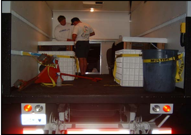
Figure 5. Penguins being transported in crates secured in a refrigerated truck.

the time interval to and from the air freight office to the plane can be minimized. If possible, the animals should be transported through the VIP or DASH systems of freight transportation that many airlines have available. The most direct flights should always be used. Accompanying staff should ask the airline if the birds can be loaded onto the plane last, so that they can be the first off-loaded. Prior to loading the birds on to the aircraft, airline personnel will strap the penguin crates down to the "cookie sheets" which then slide into and are fastened onto the bottom of the plane for a secure ride. Airlines will often accommodate special needs of penguins so it is important that these are discussed in advance.