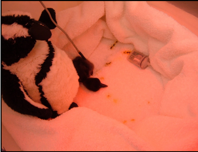
Figure 15. An Adélie chick in the brooder with a towel to prevent the young chick from wandering away from the heat source. A temperature probe and an Onset HOBO ® temperature data logger have been placed in the brooder to record temperature variations.