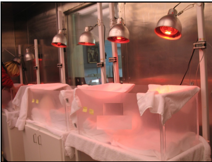
Figure 14. A closer view of Plexiglas ® brooder boxes on brooder stands. Note arrangement of toweling inside. Digital readouts are mounted on each vertical pole with temperature probes extending into brooders.