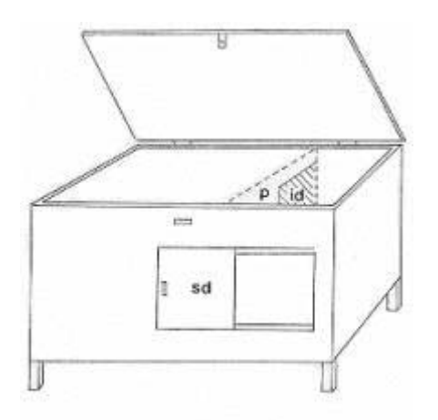
Figure 4: Sample den box that could be used to den pregnant female Eurasian lynxes (Mellen, 2003)

Pregnant females should be provided with at least one den box, preferably two. See figure 4. The den box must allow the female to stand up and turn around in the back half of the den box. The box should have a sliding door in the front of the box to provide easy access. The hinged lid must have a 20 centimetres overhang at the front and 10 centimetres at the sides to prevent water getting into the box during cleaning or inclement weather. The box should contain a partition that limits light and draughts, providing additional seclusion for the female and cubs. Wood shavings can be provided as a substrate. The den box should be placed on the floor of the enclosure with legs that raise the box 10 centimetres of the ground. Den boxes can be made of wood or plastic (Mellen, 2003).