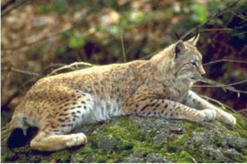
Figure 1: The Eurasian lynx

The ground colour of the fur of the Eurasian lynx is brownish-yellow, but can vary to rusty or reddish brown (Anonymous, 2000). Greyish colours dominate in the wintercoat (Tomkins, 1962). There are three main coat patterns: predominantly spotted, predominantly striped and un-patterned (Anonymous, 2003a). The spotting is dominate in the summer and is almost barely visible in the winter phase (Anonymous, 2000). Pelt colours also vary within and between the species range (see under 'Description'). The colouration of the coat serves as a perfect camouflage in wooded areas (Anonymous, 2003b). Their underbelly and face are of a lighter cream colour (Anonymous, 2003c). The ears have tufts of dark hair and the backsides are black towards the tip, showing light central spots (Anonymous, 2000). Their white whiskers frame their muzzle (Hernandez, 2002). The irises are yellow brown to a light yellowish green colour. Eurasian lynxes have a black tipped tail (Anonymous, 2000). See figure 1.