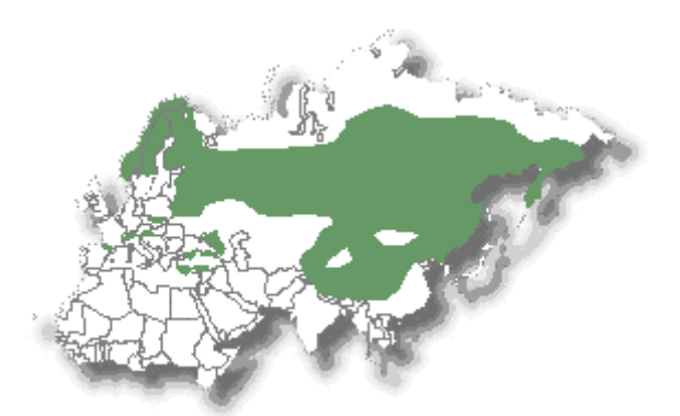
Figure 2: Distribution of the Eurasian lynx (Garman, 2000)

Currently, the Eurasian lynx is found in Europe, the Russian Federation and Asia (Anonymous, 2003a). See figure 2.